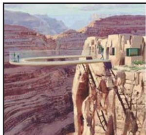
Grand Canyon Skywalk

10 miles from South Cove boat ramp on Lake Mead.