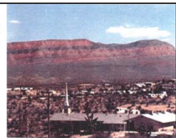
Meadview Grand Wash Cliffs

*BURGERS, STEAKS AND EGGS ARE SERVED COOKED TO ORDER. *The Arizona Health Department requires us to inform you that consuming raw or undercooked meats may increase your risk of foodborne illness especially if you have certain medical conditions.